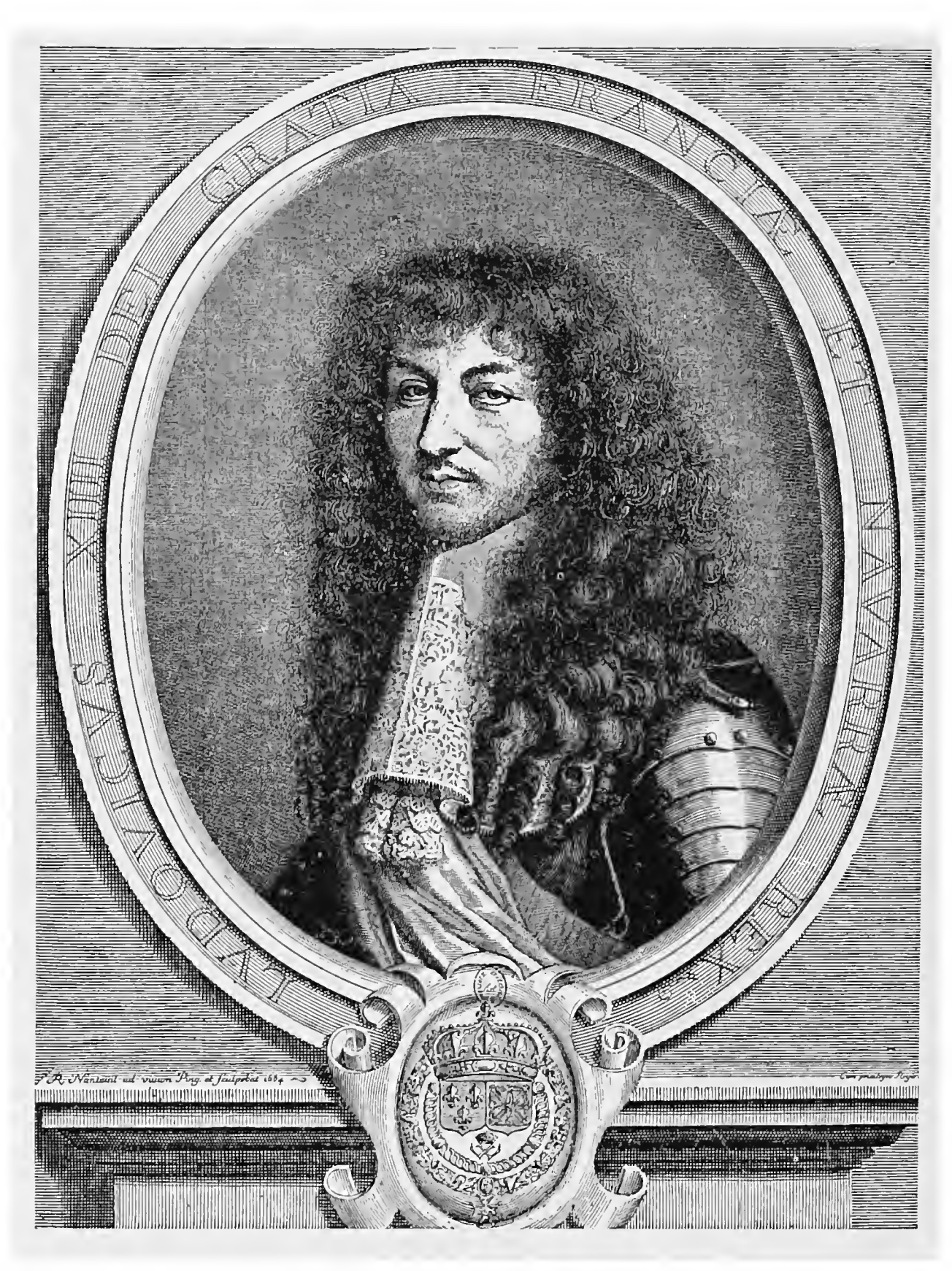
KING LOUIS XIV

From the engraving by Nanteuil "Ad vivum, 1664"